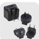
MUA-11 Universal USB Adaptor