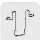
BC-01 Belt clip