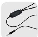
NL-100 Induction Neckloop