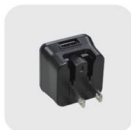
MUA-01 USB Adaptor