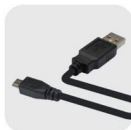
USBY-01 USB-microUSB cable