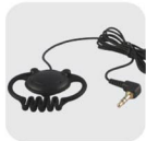
EP-01 Single-sided earphone