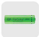
RB-2600 "AA" Ni-MH Rechargeable battery