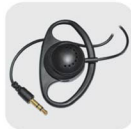
EP-11 Single-sided earphone